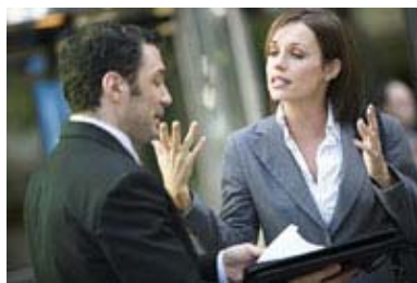
The French may seem negative on

Being right is not important at this stage and participants can add to both sides. You may be surprised to find that some people actually contradict themselves! This isn't a sign of confusion. Rather, they are showing their 'intelligence', that is to say, their ability to think out an issue. The doubts they express aren't a sign of weakness, but cues for thoughtful discussion.